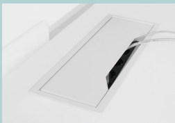
Metal grommet: 317x119 mm, H=27 mm