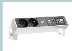
External power socket blocks