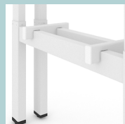
Set of desks connecting components