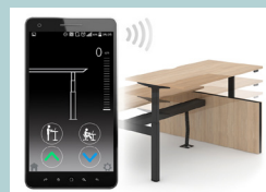
App control via Bluetooth (iOS, Android)