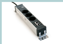
Power socket blocks