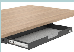
Felt-lined metal drawers with lock